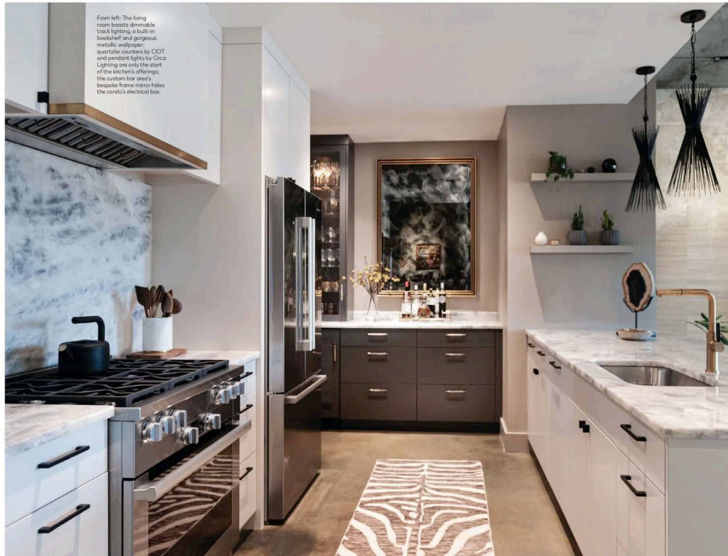
From left: The living room boasts dimmable track lighting, a built-in bookshelf and gorgeous metallic wallpaper; quartzite counters by CIOT and pendant lights by Circa Lighting are only the start of the kitchen's offerings; the custom bar area's bespoke frame mirror hides the condo's electrical box.